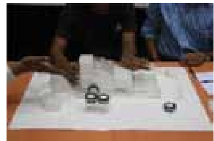
Fig 1: Concrete Participatory Toolkit