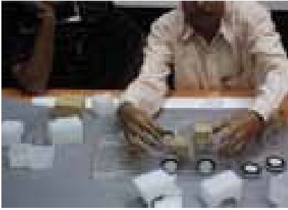
Fig 3: Concrete-Abstract Hybrid Participatory Toolkit.

mostly had no precedents. These keywords were about modularity, multilevel design, sleeper berths, touch-button controls etc (Refer Transcript Excerpt 2). This form of toolkit helps elicits more abstract responses in its natural use.