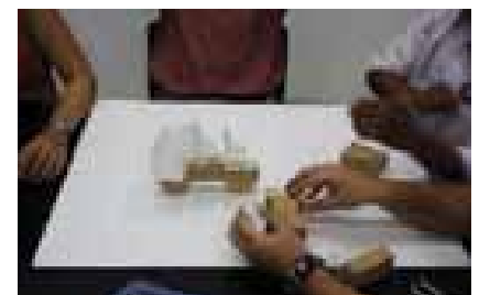
Fig 4: Abstract-Concrete Hybrid Participatory Toolkit.