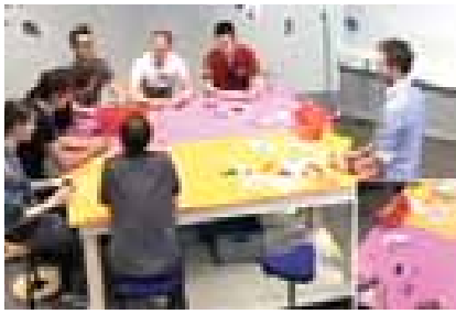
Figure 3: Sitting arrangement in the room.

ing the whiteboard, whereas J is seated a bit away from them, and with his back to the board, in a way a teacher would be placed in a classroom.