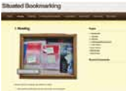
Figure 7: Situated bookmarking webpage.

A digital version of the wall of fame was created to disseminate the outcome of the workshop and expand the possibilities for feedback outside the eLearn Center. Visitors could watch the safari presentations from the four groups, read through the concepts that were generated during the workshop, leave comments about what they liked from the concepts, envision what they would like to have in the future, and read the comments from other visitors and participants. Figure 7 shows the tab developed for the reading situation. Each situation had a tab with a picture taken from the wall of fame, a description of the concept taken from the safari presentation and a space to comment.