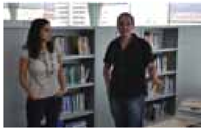
Figure 5: Photo from two members of group 1 role-playing.

The design field has a tradition of design critique that serves as a form of reflection, evaluation, reuse of knowledge and accountability (Wolf et al.