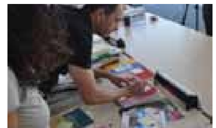
Figure 4: Photo taken during group intervention done by group 1.

The concepts developed by each group were related to social reading, supporting pre and post meeting activities, enhancing inspiration behind the computer, and posting informal questions during free time. Group 1's concept was about social reading. Its value was that it supported discovering new books and new interesting topics. The starting point (based on the exploration phase and the observations they made) was to classify books and journals in a certain way useful to each of them. They chose organizing actions from the situated media framing program as their personal take on how the situation should be transformed (fig-