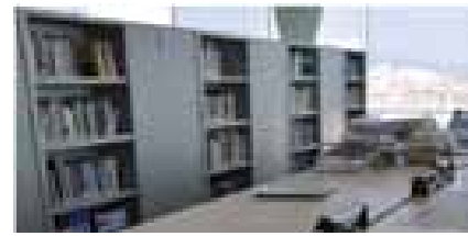
Figure 2: Photo from the library at the eLearn Center.

In the exploration phase of the co-reflection workshop, sensitizing packages were filled, analysed and applied directly by the stakeholders as in autoethnography. Stakeholders were challenged to do in depth observations on a specific topic by constraining their explorative actions through specific techniques. They grew their understanding on their surroundings by reflecting on their personal experiences and analysing them. Autoethnography through diary-tables was the technique developed with this specific aim. Diary-tables focused on one specific situation and were meant to be filled