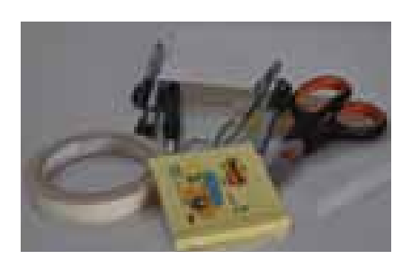
Figure 3: Material used during the group in tervention.

The aim of group intervention was to: set the expectations between stakeholders and designers, define the boundaries of the design research project on situated bookmarking and define the design space. Group intervention used a framing program based on the research done on situated media (Güven & Feiner 2006). Situated media refers to multimedia and hypermedia that are embedded in the environment (Güven & Feiner 2006). The framing program on situated media defined how the consumption and creation of digital media would be transformed by the inclusion of the social and physical domains as part of the content. These specific directions for the transformation were based on constructivist learning tasks for computer mediated learning environments: discussing,