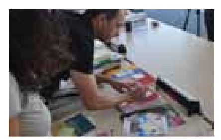
Figure 4: Photo taken during group interven tion done by group 1.

The concepts developed by each group were related to social reading, supporting pre and post meeting activities, enhancing inspiration behind the computer, and posting informal questions during free time. Group 1's concept was about social reading. Its value was that it supported discovering new books and new interesting topics. The starting point (based on the exploration phase and the observations they made) was to classify books and journals in a certain way useful to each of them. They chose organizing actions from the situated media framing program as their personal take on how the situation should be transformed (fig-