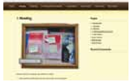
Figure 7: Situated bookmarking webpage.

A digital version of the wall of fame was created to disseminate the outcome of the workshop and expand the possibilities for feedback outside the eLearn Center. Visitors could watch the safari presentations from the four groups, read through the concepts that were generated during the workshop, leave comments about what they liked from the concepts, envision what they would like to have in the future, and read the comments from other visitors and participants. Figure 7 shows the tab developed for the reading situation. Each situation had a tab with a picture taken from the wall of fame, a description of the concept taken from the safari presentation and a space to comment.