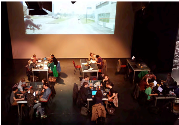
Figure 2. Hall with participants of Hackday Data of the Crowds 2014.

For the hackday, April 9 th 2014, we as university invited design companies to which the university was already related for curriculum purposes, internships and as advisory board. In the end 17 participants from 4 companies were involved in the hackday. Public servants were not involved as active participants but three public bodies of the city of Rotterdam brought in a dataset to be used by participants. Students and lecturers of the university were internally invited to join. 14 students took up the challenge. The event was announce through a website, Twitter account and a Facebook-page, through which 2 citizens signed up for the event. See also table 3 for an overview of the participants per helix.