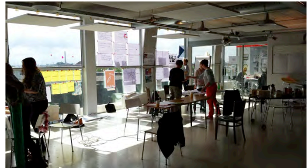
Figure 2. Event space with participants of Gov Jam 2014.

focus on human needs. The hackday started at 10 AM and ended at 7 PM with pitching he prototypes to a jury of experts. A Fitbit was granted as first prize to the winning team, and gift coupons as second and third prize.