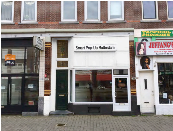
Figure 4. The Smart Pop-up lab in a local shopping street.

PARTICIPATORY PROTOTYPING LAB SMART POPUP During one school semester, September 2014 – February 2015, we established a lab, Smart Popup, in a neighbourhood in the city of Rotterdam, for 10 4 th -year bachelor students who signed up for a minor course.