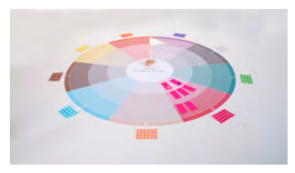
Figure 1: Value Pursuit game board