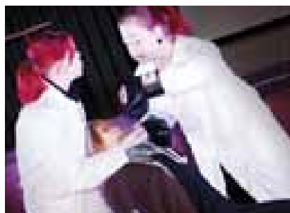
Figure 1: An example of Forum Theatre scene.

It seems that the “in the corridor”-phrase on stage refers to the situation in real life as well as spectators’ imagination and events on the stage. Thus we suggest that aesthetic space of the Forum Theatre is a bridge from real life actions and reflection of it. Through aesthetic space it is possible to demonstrate the present situation of reality as it is experienced and it also offers a place for simulations of various situations as if it might happen.