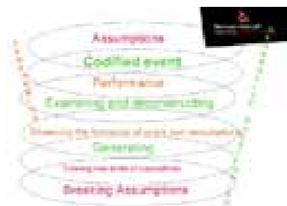
Figure 2: The framework of learning processes in aesthetic understanding.

Our study suggests that theatre, as an element of participatory innovation activity, offers methods for both ex-