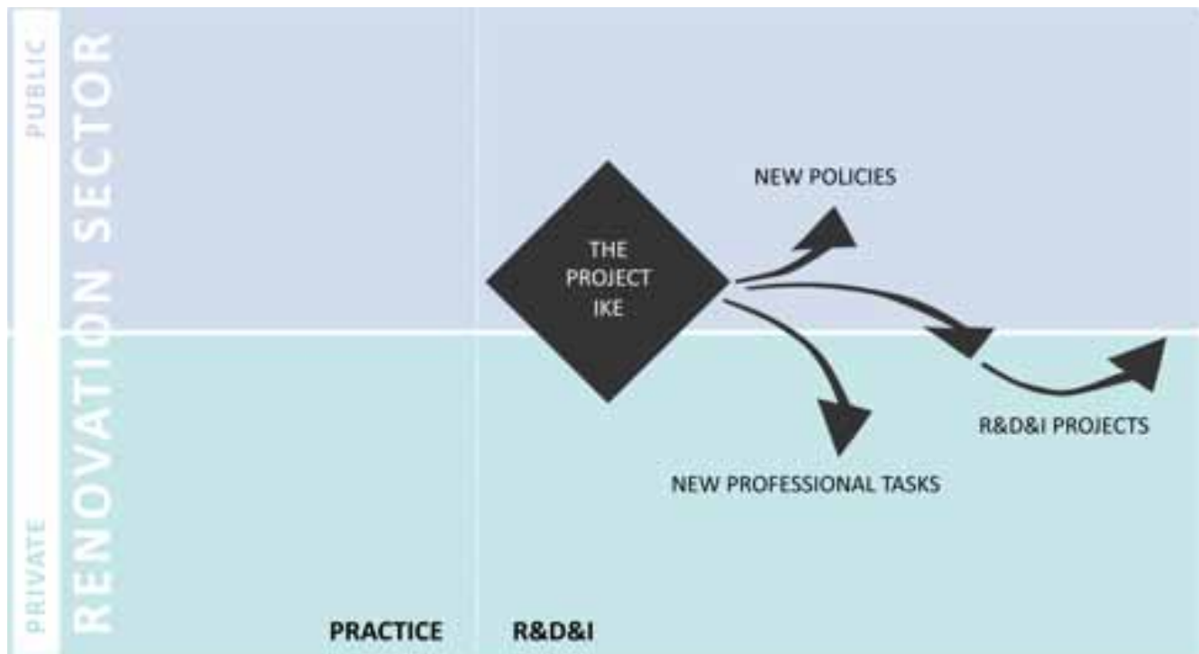
Picture 1: The project IKE was co-funded by public and private sector. It led to an array of consequences within two years after it was ended. Examples of consequences are: new policies, follow-up R&D&I projects and new professional tasks.

in order to ensure timely introduction of the new solutions into public services and other markets.” (European Commission 2007:8). Rolfstam (2009:353) states that innovation diffusion requires certain circumstances, “a social system may not adapt an innovation if it does not match the prevailing institutional set-up”. When dealing with public problems, the set-up need to be identified, i.e. what kinds of stakeholders there actually exist, or should exist.