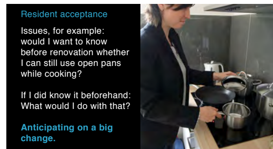
Figure 4: this figure illustrates a prospective resident's interaction with the technology of a new house - the cooking area with its ventilation, and highlights an issue that can influence later resident acceptance.

to the way living practices might change when moving house. This process should receive careful attention in the showroom model, which aims for a much faster process of adoption.