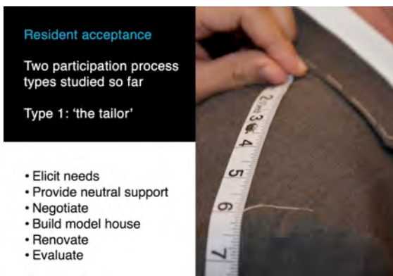
Figure 2: the 'tailor' model renovation process approach.

Process type 2. The second type of process is exemplified in the Dutch sustainable renovation project 'stroomversnelling' ( www.stroomversnelling.net ). Its principle is to offer a complete prototype renovation within a neighbourhood that people can visit and experience. Even activities are organised in such demonstrator houses. From a participatory design perspective, this approach seems very beneficial because it enables residents to imagine their new lives through such a house as a prototype (Ehn, 2008). Simply being in the new house and being able to imagine one's future comfort is a successful way of gaining residents' trust and enthusiasm (E1). In the Dutch housing sector, it is common to build and plan housing according to a four-part lifestyle division called "Brand Strategy Research Model" (SmartAgent, 2012). Proponents of the 'showroom' model aim to create more detailed personas in order to address resident types even better, based on their adoption behaviour (E1). Figure 3 summarizes the approach of the 'showroom' process.