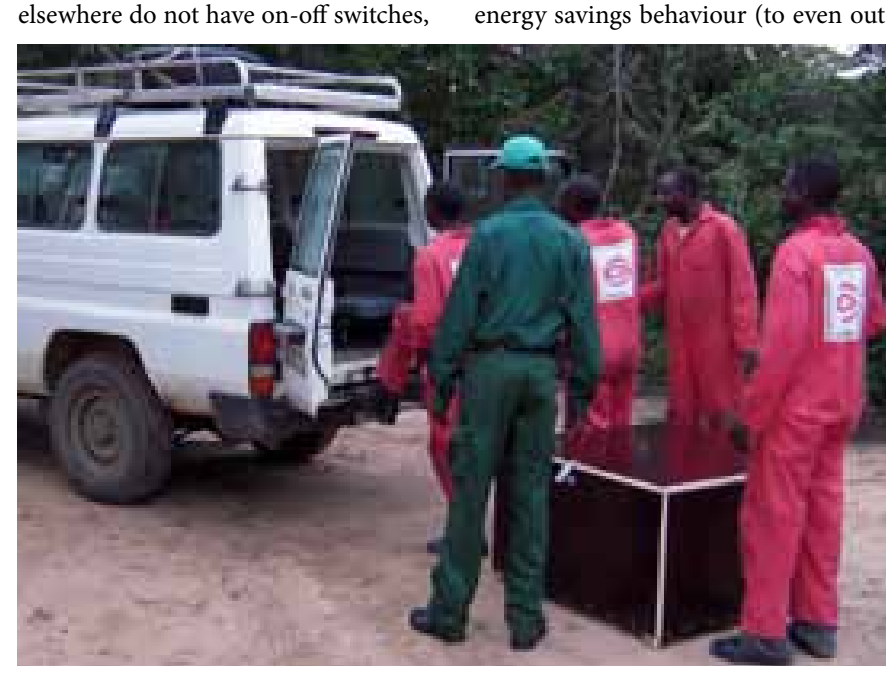
Figure 5. Angolan deminers test the handling of a mock-up of the converter unit, at a time when measurements were yet unknown. The mock-up was simply an empty plywood box 100 x 100 x 50 cm containing batteries for weight. Based on this experience, all agreed that this size was far too big for easy handling.

What is the value proposition actually? From the outset, the energy grid researchers suggested that the core challenge of this project is to develop a grid unit that converts the DC current from the various alternative energy