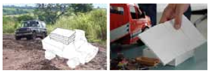
Figure 1. The combo concept. All components of the sustainable energy generator packed in one box to be transported by truck. Sketches and models are based on viewing video footage.