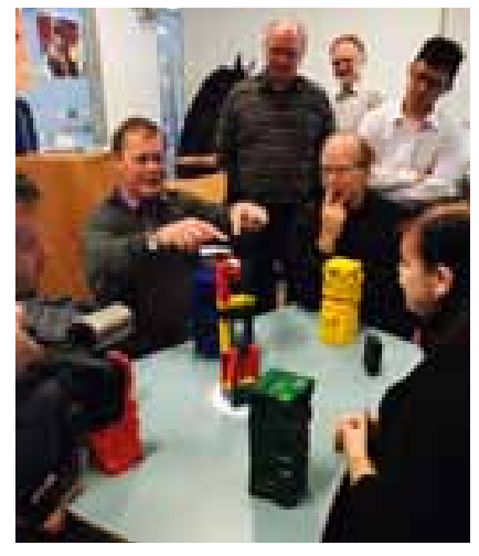
Figure 7. Managers of small, Danish companies play the Joint Venture game. A 'tangible business model' that encourages participants to discuss how several companies may pool resources and create revenue in a joint development country venue.

To support this dialogue between the partners, SPIRE solicited graduate students to design a 'tangible business model' that would encourage the companies to explore investment options in a playful manner. The students developed a brick game in which each of four company owners contribute resources (coloured bricks) to a joint venture (tower) in Africa from their own companies (towers) in Denmark, Figure 7. The 'Joint Venture' game has three phases: In the first, the players