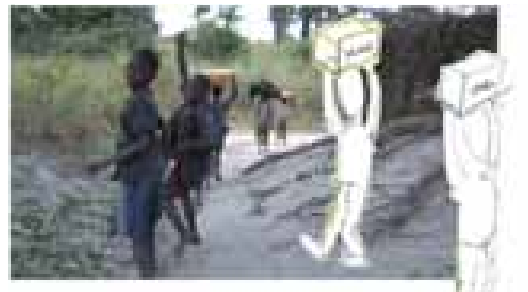
Figure 2. The module concept. Each part of the generator are transported piece by piece and then assembled by technicians in the camp.

a significant variety in development practices from concrete customer adaptation via high-tech development to university research.