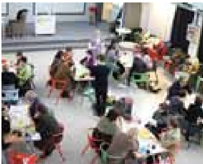
Figure 1: Workshop setting in a context of public service development

Three co-design workshops were organized to support the planning and launching faces of a new Service Journey -project for social and healthcare entrepreneurs, which was a continuation of the earlier three pilot projects.