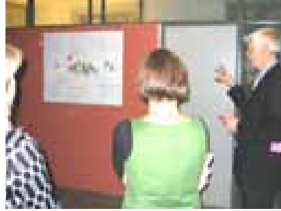
Figure 5-6: Participatory project meeting. With the help of visual map project group tried to achieve consensus and negotiate about the project and research goals.