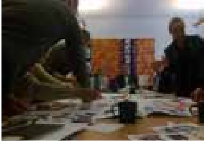
Figure 4: Project group in a middle of a quick exercise and introduction to the mindset of the working method before the workshops.