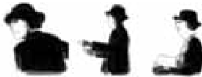
Figure 2. The manager roleplay.

A powerful tool to trigger stories is to tell stories. This is known from colloquial interaction: a first story tends to trigger a second one, even rounds of stories where participants take turns as narrators (Sacks 1992 [1968], 3-8; 1992 [1970], 249-261; Ryave 1978; Sidnell 2010, 185-187).